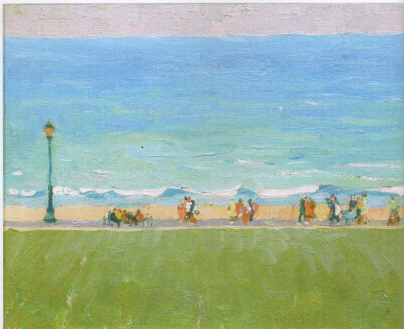
Jane Peterson (1876–1965), Promenade on the Beach , 1925. Oil on canvasboard, 12 x 16 in.