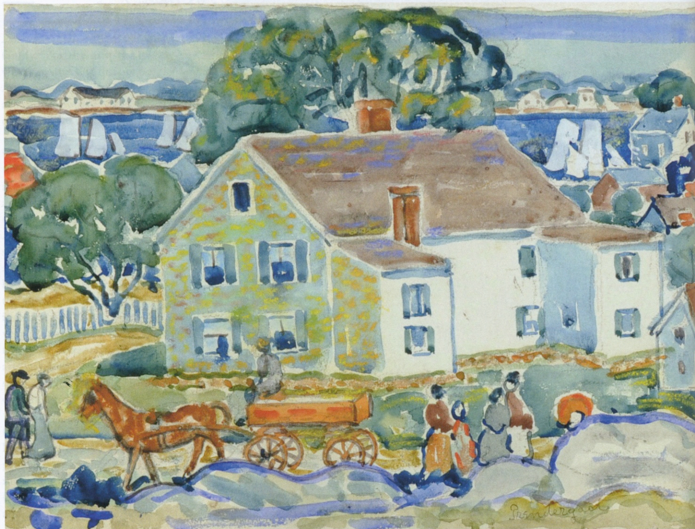
Maurice Prendergast (1858–1924), Bayside Marblehead , ca. 1920–1923. Watercolor, pastel and pencil on paper, 11 \frac{1}{2} x 10 \frac{3}{4} in.