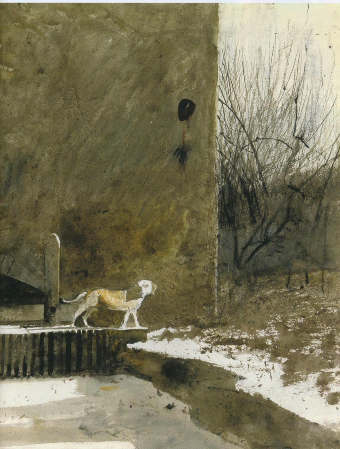
Andrew Wyeth (1917-2009), Frozen Race , 1969. Watercolor on paper, 20¼ x 29¼ in.