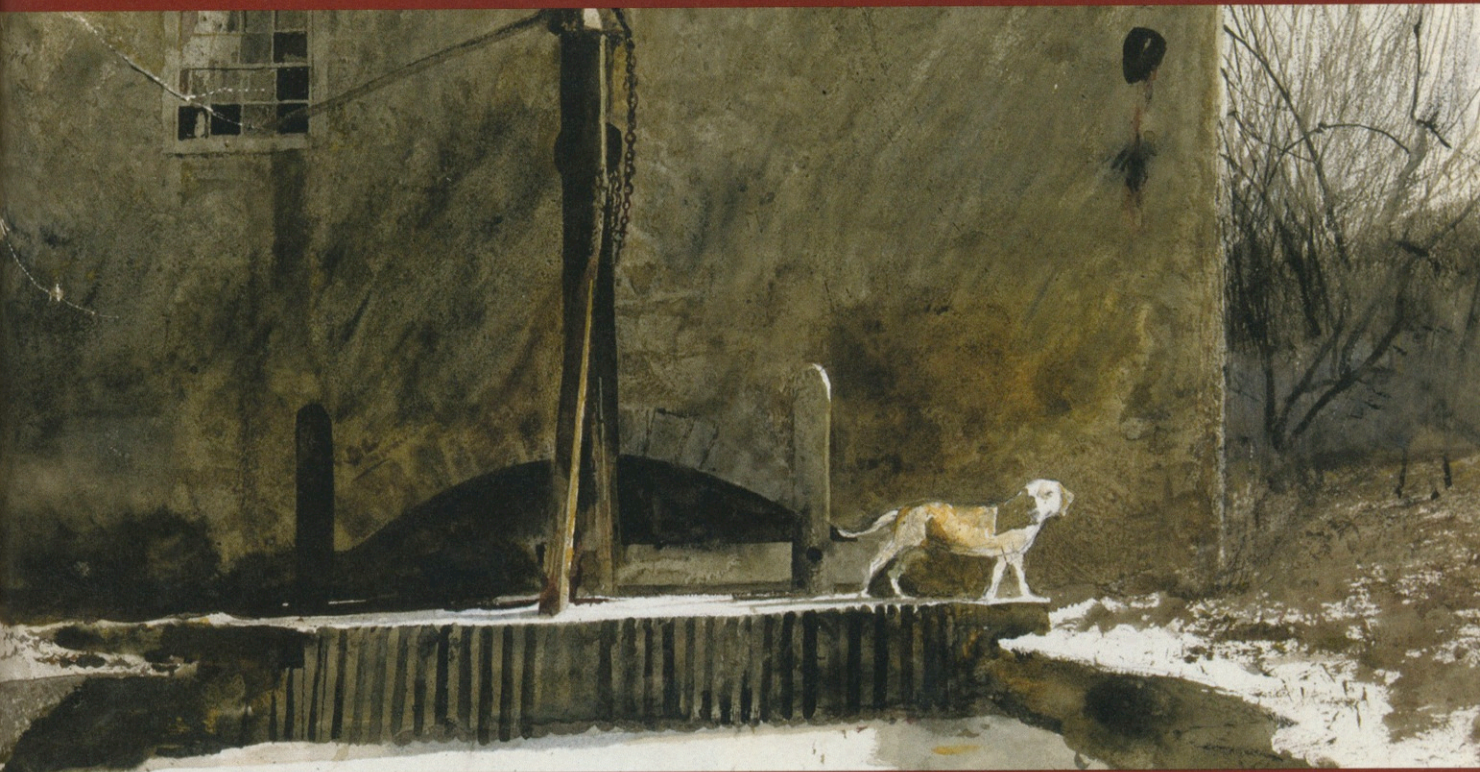
Andrew Wyeth (1917-2009), Frozen Race (detail), 1969. Watercolor and tempera on paper, 20¼ x 29¼ in.

Previews of upcoming shows of historic American art at galleries across the country.