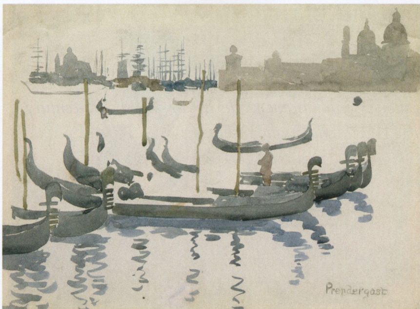
Top: Maurice Prendergast (1858-1924), The Gondolas, Venice , ca. 1898-1899. Watercolor, 10¼ x 15 in.