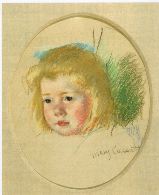
Mary Cassatt (1844–1926), Sara , 1901. Pastel on paper, 17 \frac{3}{8} x 14 \frac{3}{4} in