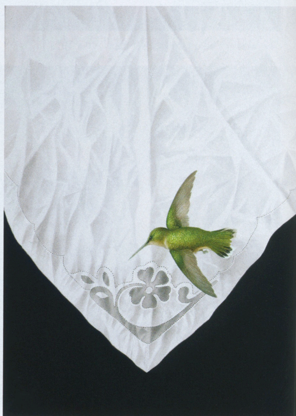
Oh Hummingbird , watercolor, 29 x 21"