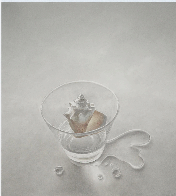
Clearwater , watercolor, 23 x 19"