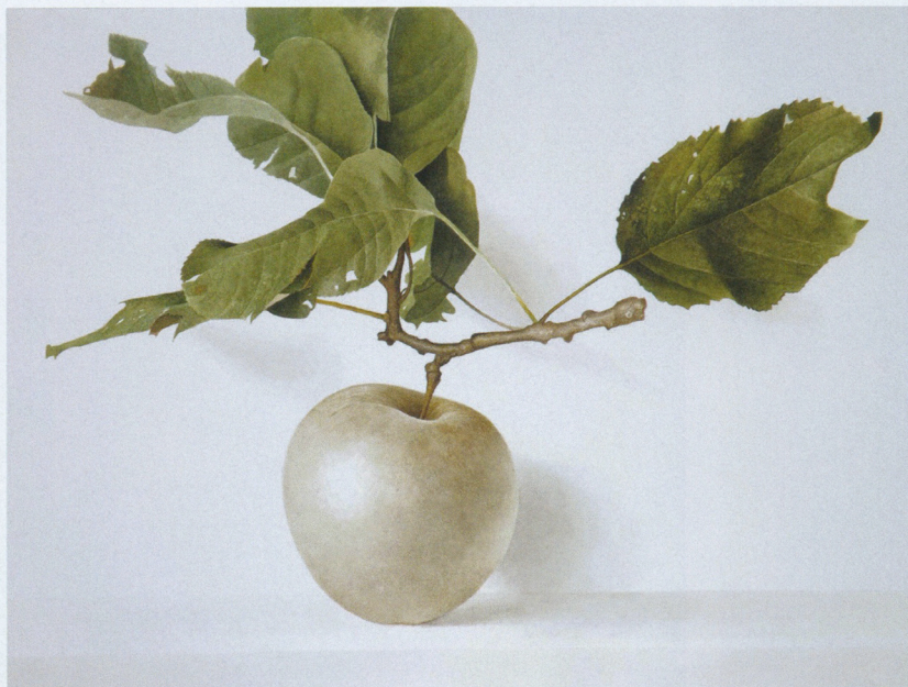
Apple White , watercolor, 26 x 34"

our tiny oasis in space. Art speaks a common language not unlike music that transcends cultural, political and racial borders. It is one of the world's oldest forms of communication and relates to the most rudimentary area of the human mind. Imagery has a direct pipeline to both the emotional, cerebral and memory regions of the human thought process. This is why I have encouraged other artists with The Art of Stewardship Project to use their talents to support and build environmental awareness."