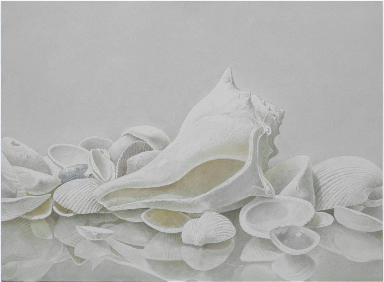
Shades of White , watercolor, 21 x 29"