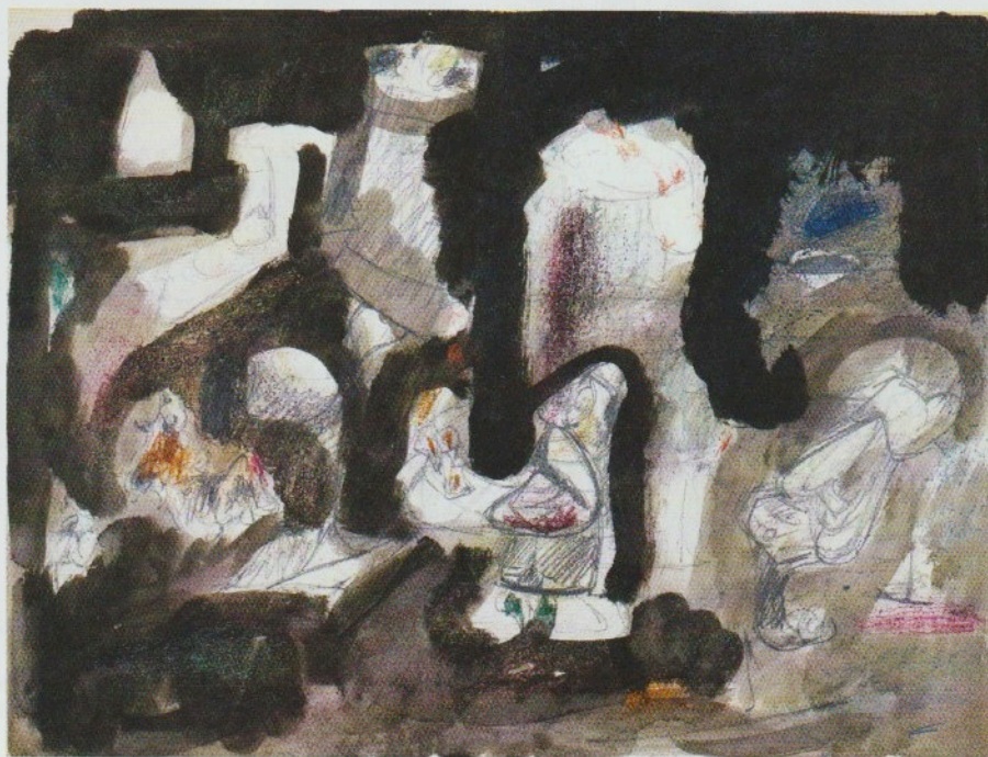
Arshile Gorky (1904-1948), Untitled, ca. 1946. Pencil, pastel and wash on paper, 18¾ x 24 in.