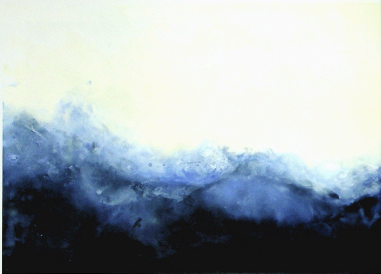
Fathom , 2018 30 x 70 inches Encaustic on panel

ment's Art in Embassies Program in Papua New Guinea and the Solomon Islands, where she was sent to "teach and convey the message of female empowerment." While recounting this experience, her tone gets a little more serious: "There is a part of humanity that really needs essential experience. We need to keep art and culture alive."