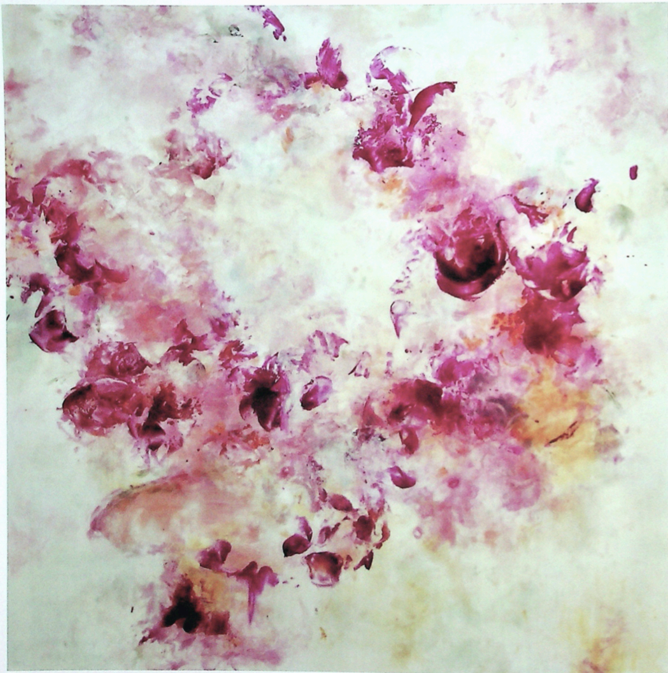
Pleasure Principle , 2019 60 x 60 inches Hot wax, cold wax, ink, oil on prepared aluminum