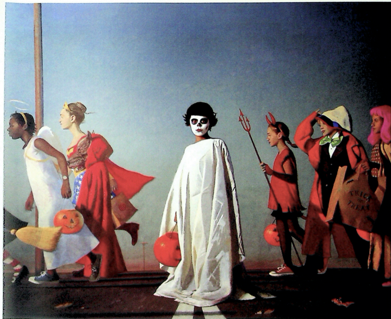
Opposite: Things Don't Stay Fixed , 2019 80 x 100 inches Oil on linen