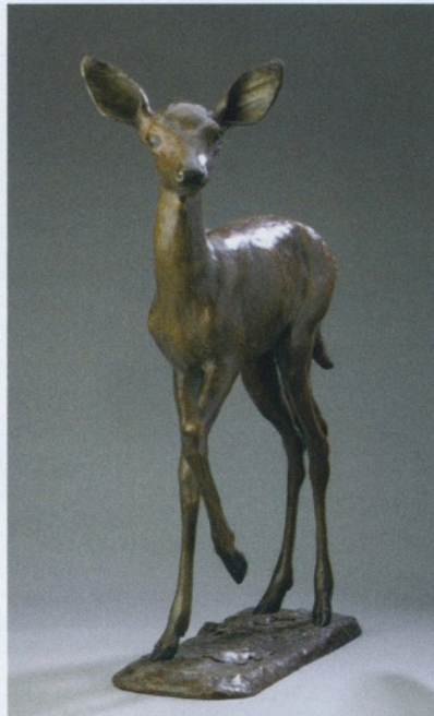
Julie , bronze, ed. of 24, 26½ x 22½ x 5"