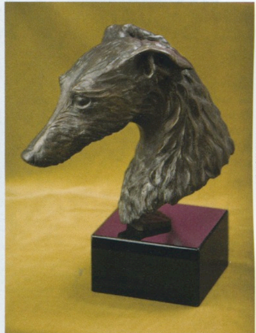
Frisky , bronze, ed. of 10, 9½ x 10½ x 5"