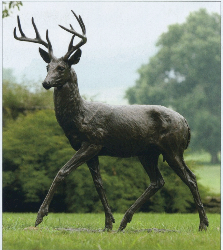
Gift in Velvet , bronze, ed. of 7, 49 x 53 x 22"

Additional bronze works available during Saunders' solo show at Somerville Manning Gallery include Alexander and Nureyev , a pair of life-size peacocks. The latter peacock was named after acclaimed Russian dancer Rudolf Nureyev whose suspended leaps and fast turns were legendary. The peacock's story, however, isn't quite as glamorous. Saunders' husband had found the peacock on the ground one evening while grilling outdoors. Turns out the bird had broken its leg, so the couple put splints on him and he recuperated in a large dog cage in the artist's studio for three months.