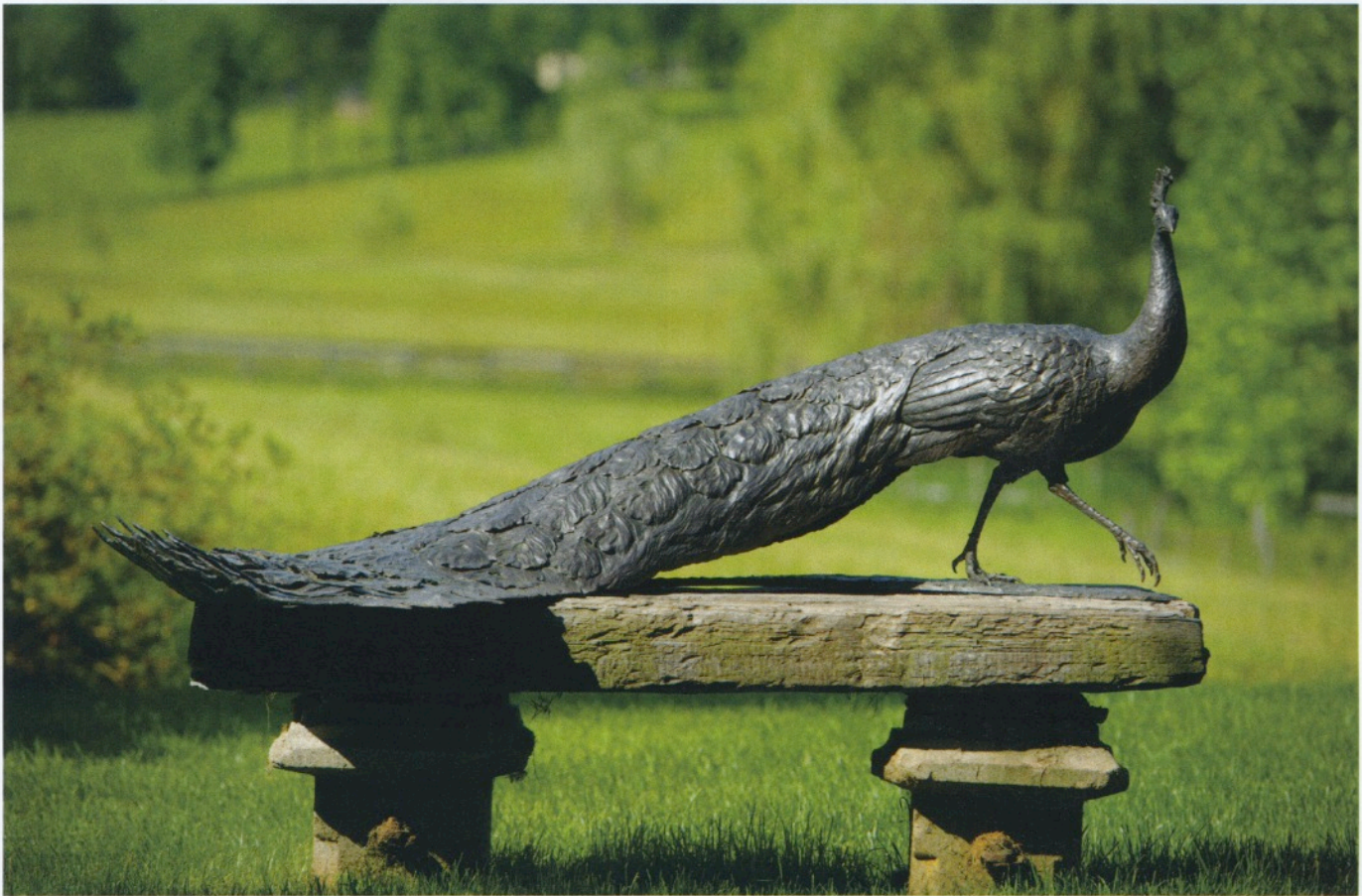
Nureyev , bronze, ed. of 12, 49 x 53 x 22"