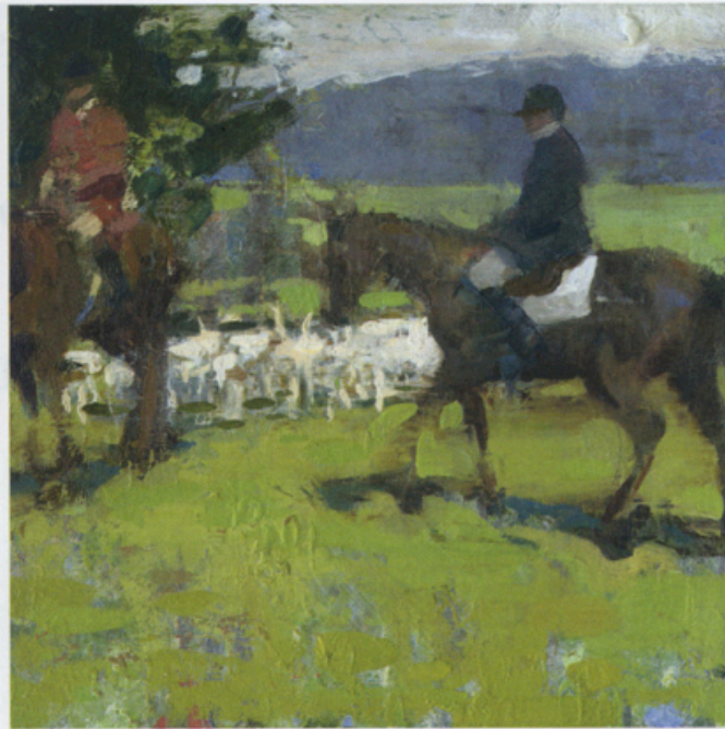
Hunt , oil on board, 10 x 10"