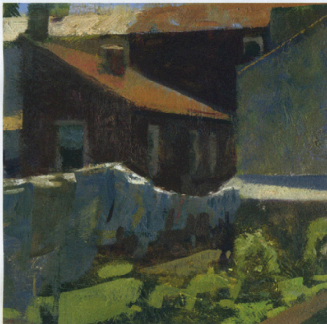
WC Laundry, oil on board, 10 x 10"