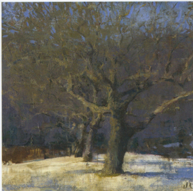
Apple Snow , oil on board, 10 x 10"