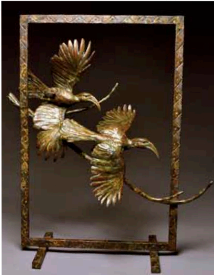
Stefan Savides , Air Africa , bronze, 31 x 13 x 38"