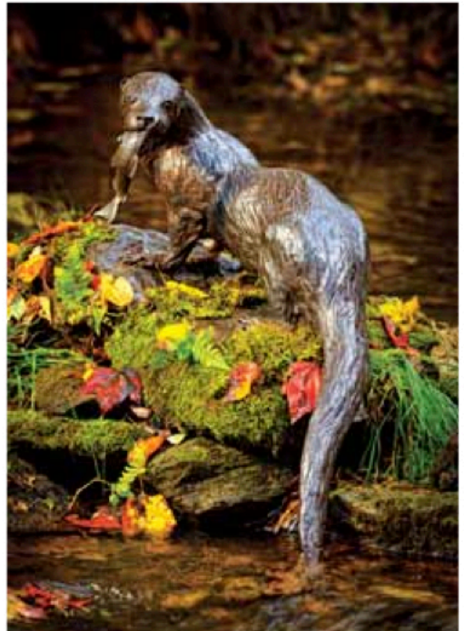
Rikki Saunders , Tarka , ed. of 7, 6½ x 38 x 12"

"Hornbills were the perfect bird to use, as they seem to be everywhere there," Savides says. "They seemed to fill the same niche, as did scrub jays in my California childhood. It was important for me to suspend them in a way to make the eye not notice their support system. The floating branch in the primitive African frame did exactly that."